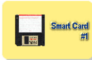
1. Memory Card a floppy disk

The pictures below illustrate what smart card capabilities really are.