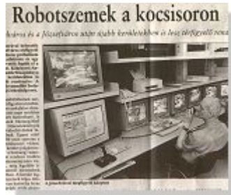
Public video surveillance