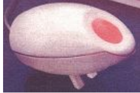
American Biometric Company's BioMouse

Biometric identification or authentication is already in use around the world at banks, ATMs, airports, government agencies.