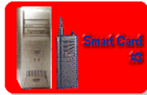
3. Contactless Microprocessor Card a microcomputer+a radio transceiver

Smart cards will possibly be replaced worldwide by a universal multifunctional smart identification card (see Summary of the Planned Universal Control System ). The universal ID card may be followed by an implantable microchip, and many believe this will be the dreaded Mark of the Beast prophesied in the Scriptures (for related Bible passages see 1. Bible Prophecies About the Mark of the Beast ) to be introduced worldwide during the Apocalypse . The main reason we are writing these articles is to warn people of these dangers.