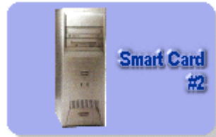
2. Microprocessor Card a microcomputer