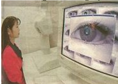
A Japanese iris identification system

already exist in the U.S. The samples come from blood taken from newborn babies, blood and saliva samples collected from military recruits, criminals, etc. Since March 1, 2000, Hungarian "law enforcement agencies may keep a DNA registry of some suspected criminals" using saliva and hair samples taken from them („Nyál- és hajmintavétel" ("Taking saliva and hair samples"), HVG , March 4, 2000). Witness ID information will also be recorded, and according to the article, "The same decree, issued on February 16, describes the detailed procedure for taking fingerprints, handprints and pictures to be stored in the criminal record system. Legally this is a step forward, since these were earlier carried out according to the directions of the under-secretary of the Department of the Interior and were not regulated by public laws." These genetic fingerprints pose a threat to individual privacy.