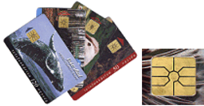
Stored-value phone cards and a close-up of a memory chip from one.

Smart cards are the most advanced plastic cards, because they can store thousands of pages of data in the embedded microchip. The chip can be either a memory chip or a microprocessor . Smart cards can be contact cards , contactless cards or combi cards , depending on their method of communication with card readers or other devices. Microprocessor-based smart cards may also be multifunctional . Some smart cards also have a magnetic stripe.